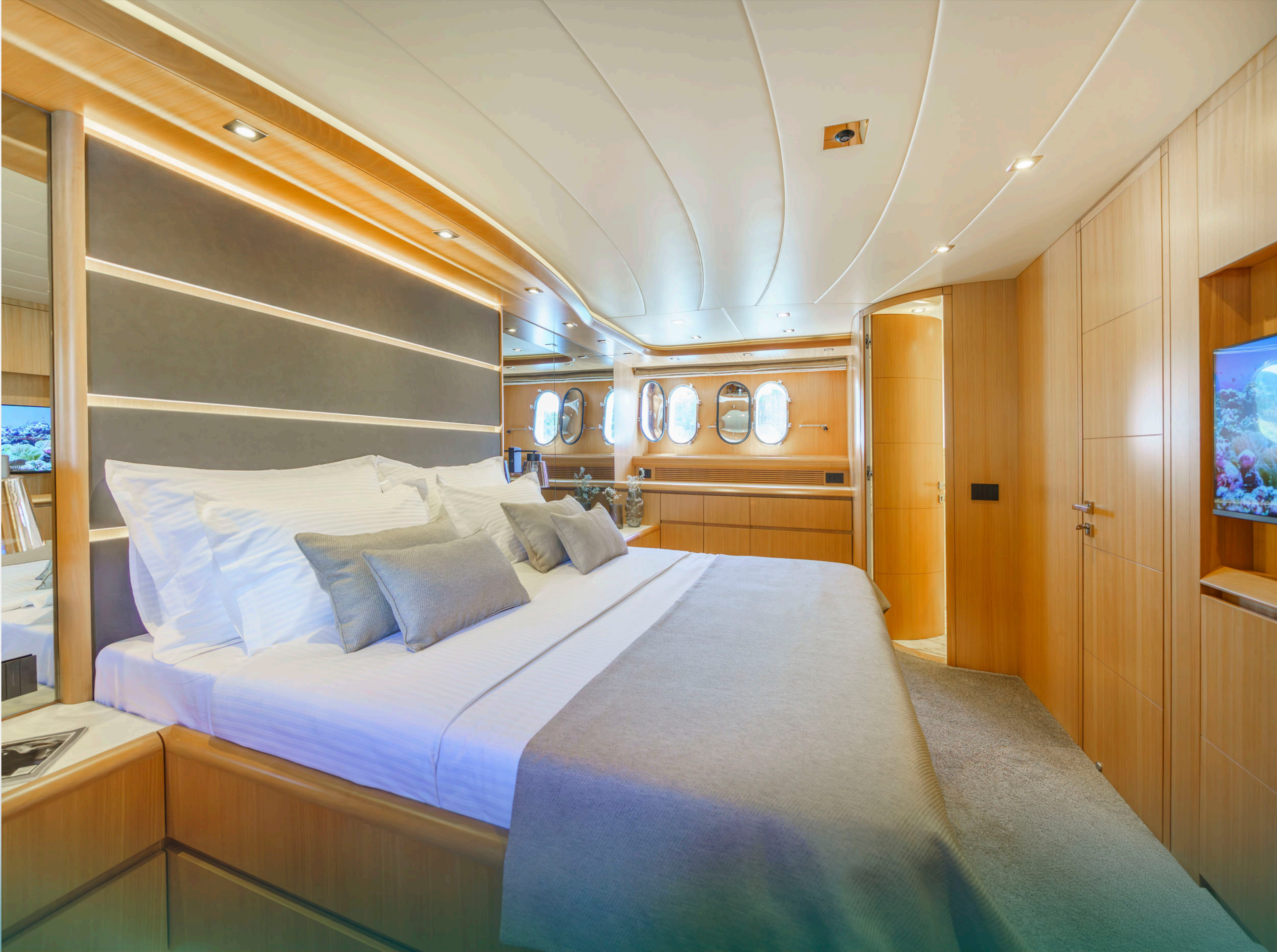
VIP cabin - main view