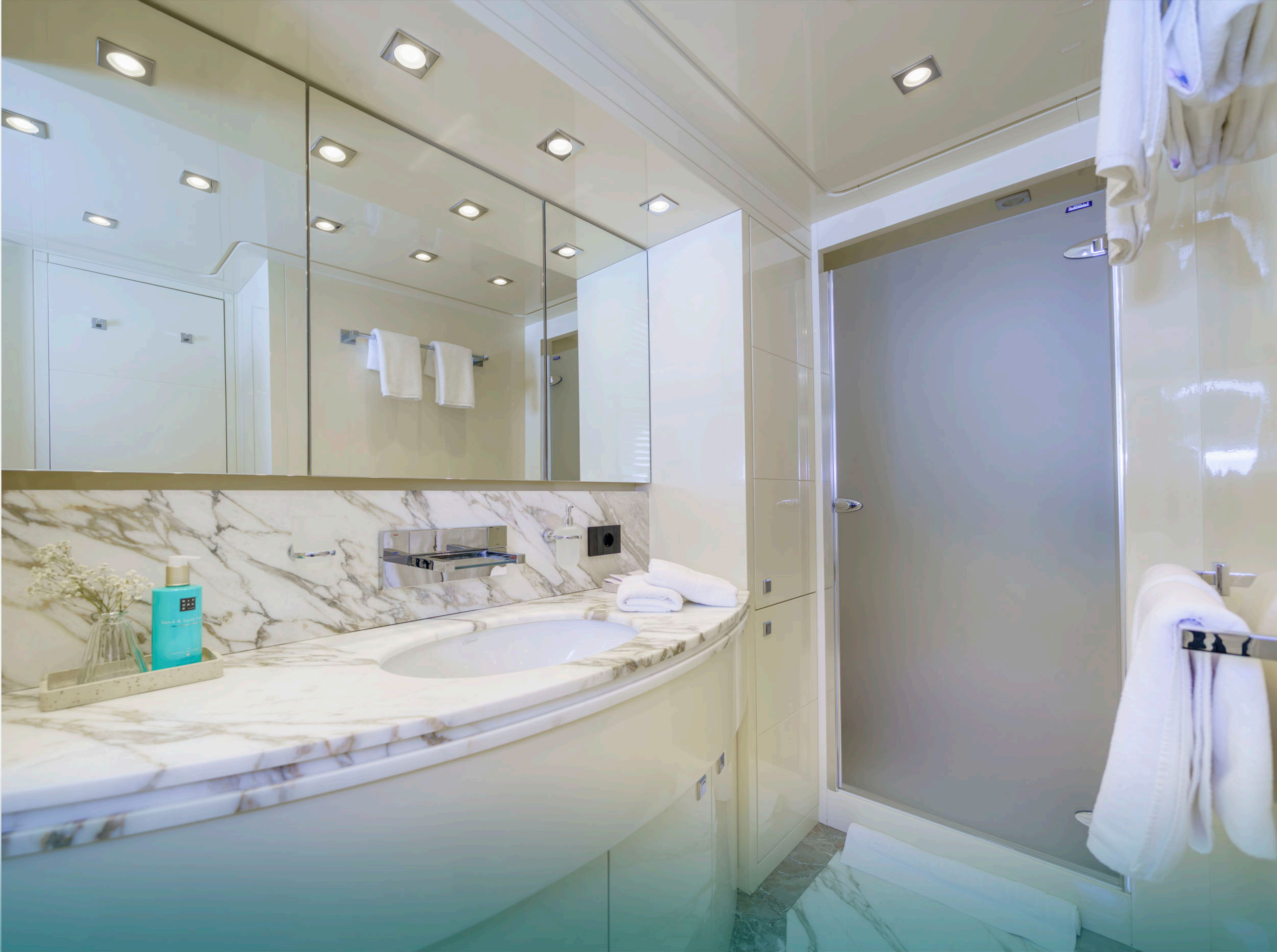
Master cabin - bathroom